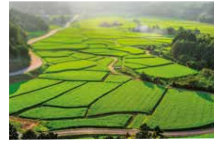
Kunisaki Peninsula Usa area, Oita Prefecture (Tashibu no Sho)