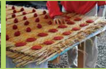
Mogami River basin region, Yamagata Prefecture (Safflower disc for dyeing)