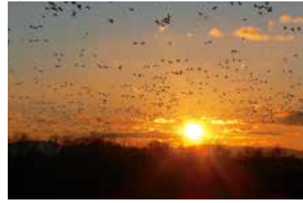
Osaki region, Miyagi Prefecture (White-fronted geese flying out in the early morning)