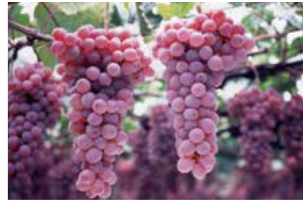
Kyoutou region, Yamanashi Prefecture (Koshu grapes)