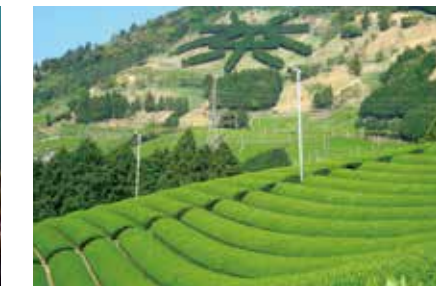
Kakegawa region, Shizuoka Prefecture (Chamoji tea character and tea fields)