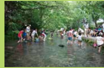
Genbegawa Irrigation Canal