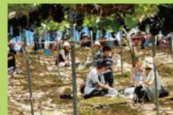
Tanzansosui Irrigation System (Tourist vineyard)