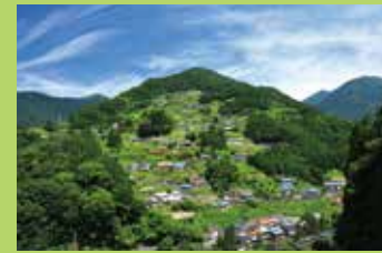
Nishi-Awa area, Tokushima Prefecture (Ochiai Village)

Beautiful, unspoiled Japanese landscapes