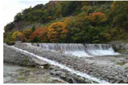
Tachibaiyousui Irrigation Canal (Tachibai Weir)