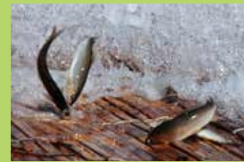
Upper and middle reaches of Nagara River, Gifu Prefecture (Ayu sweetfish)