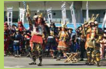
Tenguwa Irrigation System (Soja Akimoto History Festival)