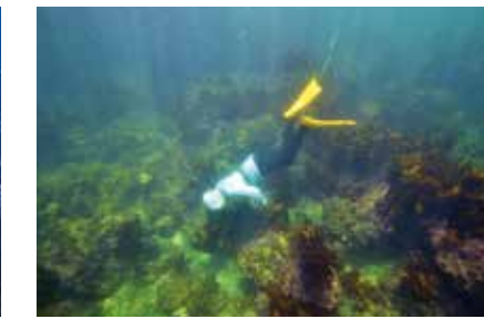
Toba and Shima regions, Mie Prefecture (Ama-Women divers)