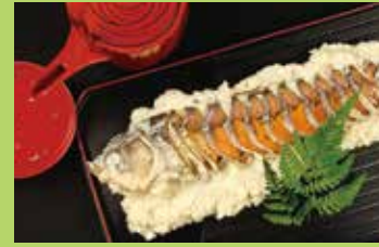
Lake Biwa region, Shiga Prefecture (Funazushi: fermented fish)