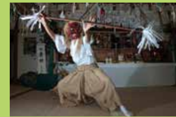
Takachihogo-Shiibayama region, Miyazaki Prefecture (Kagura)

Local history and traditions continuing today