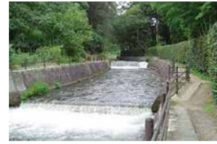
Uchikawa Irrigation System