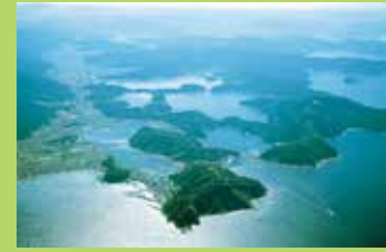
Mikatagoko region, Fukui Prefecture (Landscape)