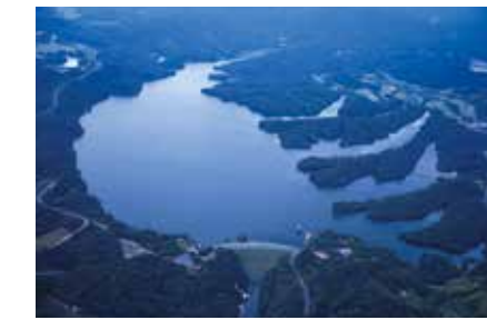
Mannou-ike Reservoir