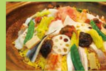
Kurayasu and Hyakken Rivers Irrigation and Drainage System (Barazushi scattered sushi)[Top 100 Rural Culinary Dishes]