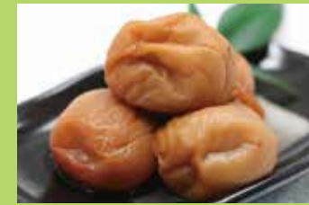
Minabe/Tanabe region, Wakayama Prefecture (Kishu Nanko plums)