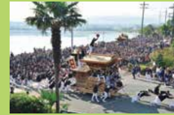
Kumedaike Reservoir (Gyoki Mairi Festival)