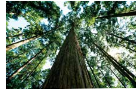
Owase City and Kihoku Town, Mie Prefecture (Owase Hinoki cypress)