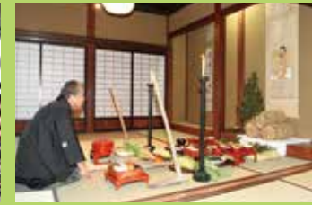
Noto region, Ishikawa Prefecture (Aenokoto agricultural ritual)