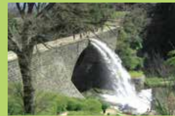
Tsujiyousui Irrigation System (Tsujiun Bridge)