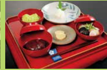
Teruizeki Irrigation Canal (full-course mochi dinner, Mochi honzen)