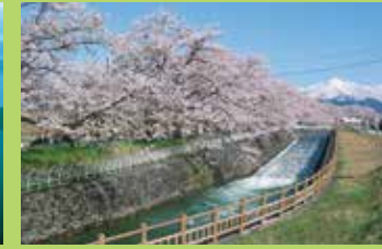
Jyosai-gokuchi Irrigation System